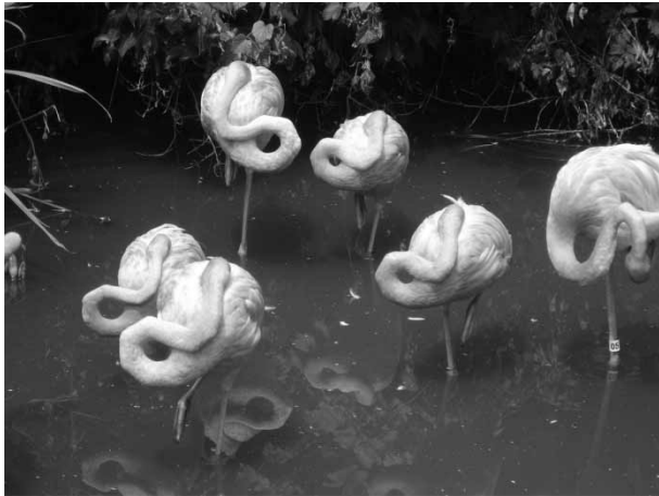
Figure 1. Caribbean flamingos resting at the Philadelphia Zoo.