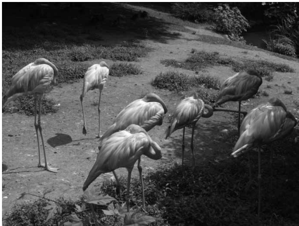
Figure 3. Resting Caribbean flamingos at the Philadelphia Zoo. Note that the left eye is visible regardless of the bird's neck-resting position. This suggests flamingos are capable of employing either the right or left eye when resting their necks in either direction.

Evans, Evans, and Marler (1993) have shown that chickens ( Gallus gallus ) primarily employ their left eye when scanning for aerial danger. This allows them to use their right eye to search for food and is thought to be an example of task sharing (Rogers, 2000). Conversely, Randler (2005) has